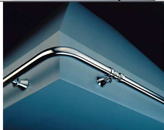
UTILITY ROD FOR COOKER HOODS material: brass tube treatment: nickel finish: satin