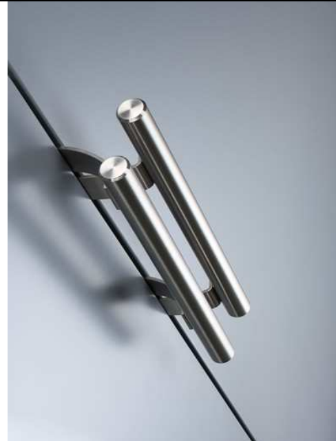
SIDE-BY-SIDE REFRIGERATOR HANDLE → material: stainless steel tube finish: satin