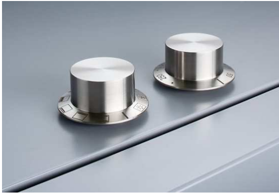
KNOBS FOR OVENS material: stainless steel finish: satin