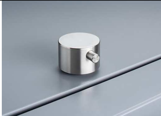
KNOB FOR OVENS material: stainless steel finish: satin