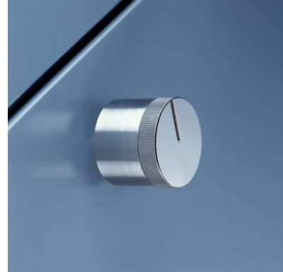
KNOB FOR OVENS Material: stainless steel finish: satin and shine